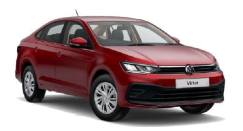
Wild Cherry Red Metallic