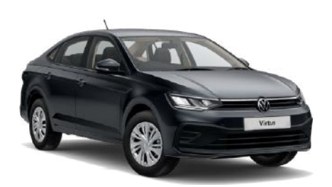
Carbon Steel Gray Metallic