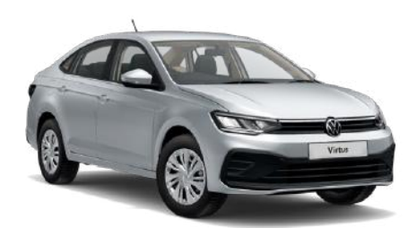
Reflex Silver Metallic