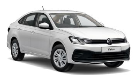
Candy White Solid Colour