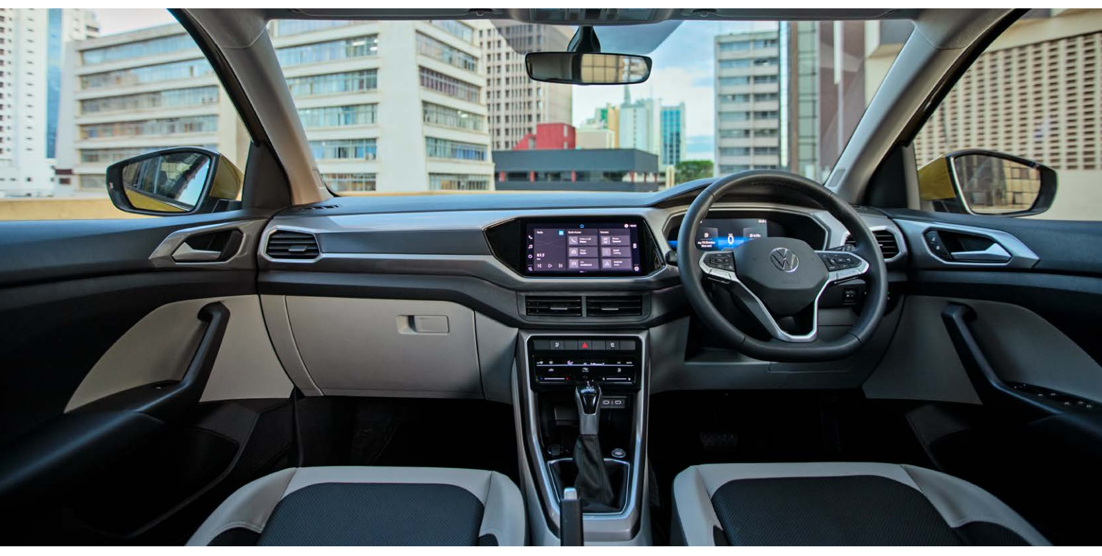
White ambient lighting