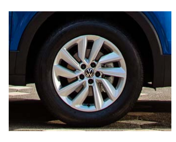
Belmont 16" alloy wheels (Standard on Highline)