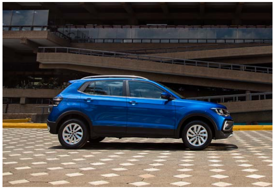
The thrill of the hustle is in the chase of perfection. With Volkswagen's revolutionary TSI engine at its heart, the T-Cross makes for a fun-to-drive yet highly efficient SUV. Available in the Highline and Topline models with 1.0 85kW engines, they're designed to deliver instant power with minimum consumption and maximum efficiency.