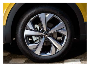
Cassino 17" alloy wheels (Standard on Topline)