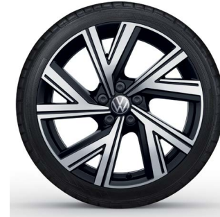
17" Bergamo Alloy (Optional on R-Line)