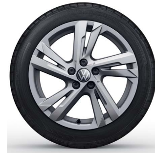
16" Valencia Alloy (Standard on R-Line)