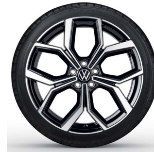
18" Faro Alloy (Optional on GTI)