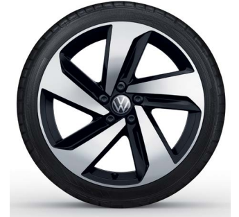
17" Milton Keynes Alloy (Standard on GTI)