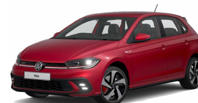
Kings Red (GTI only)