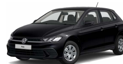
Deep Black Pearl